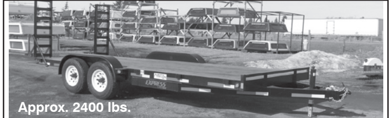
Approx. 2400 lbs.