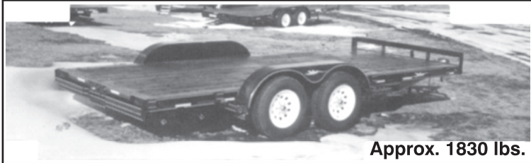
Approx. 1830 lbs.

Comes with removeable (bolt-on) fenders except tilts and split tilts and a 7-prong plug wired to Canadian Standard. There are other extras and options not listed here. These trailers are excellent pulling due to weight distribution. Most importantly, Rainbow has the best warranty in the industry.