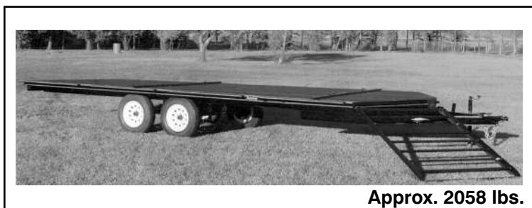
Approx. 2058 lbs.