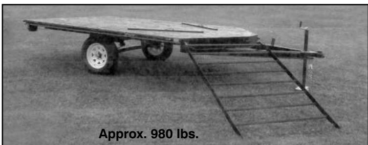
Approx. 980 lbs.

OPTIONS: Spare rim $70 Rim & tire $170 Electric brakes $275