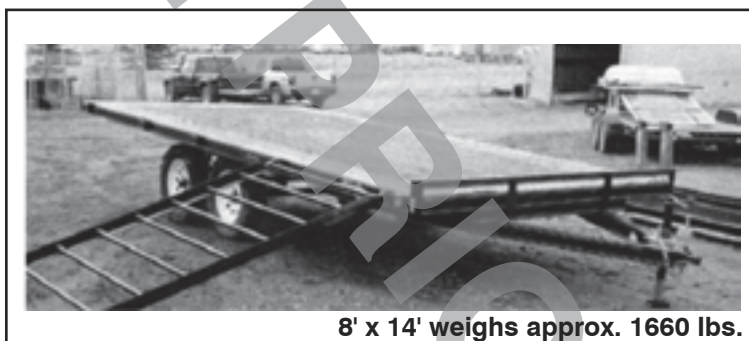
8' x 14' weighs approx. 1660 lbs.

OPTIONS: Spare rim $70 Spare rim & radial tire $170