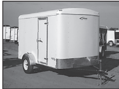
Picture shows 6' wide by 10' long by 6' high single axle XPO .