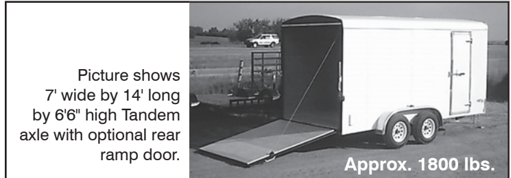
Picture shows 7' wide by 14' long by 6'6" high Tandem axle with optional rear ramp door.