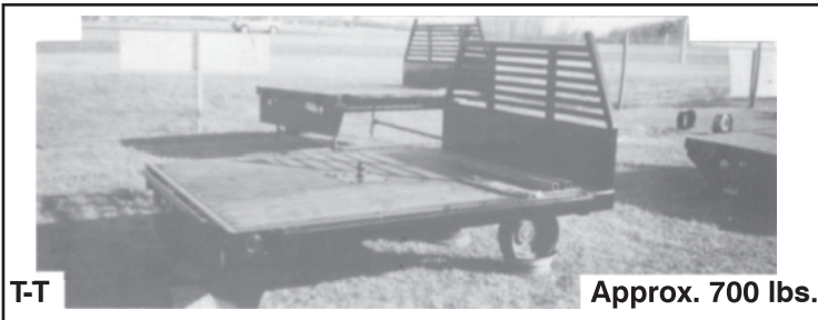
Pic. shows 8' x 78" with rear hitch, and hide-away G. N. ball mount.

STANDARD EQUIPMENT: Main frame is made of 4" channel with 3" channel cross members on 20" centres. Tongue and groove wood deck, headboard, rear skirt, stake pockets, 2 mud flaps, D.O.T. lights, primed and painted black, 6 mounting plates supplied. Main frame of these decks is for a cab & chassis unit 34" wide (outside measurement), and 37½" wide for trucks that had a box on it. NOTE: Newer cab & chassis Fords come with a wider stance therefore they should have an 8' wide deck. However practically any deck will mount on any truck by bending the mounting plates. (Note: Alberta Trailers does not install decks. Please make other arrangements.)